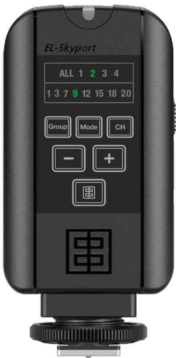
EL-Skyport transmitter Plus 19368

The EL-Skyport Transmitter Plus offers simplicity, durability and reliability. The transmitter provides remote control for use with all RX, ELC and ELB units and triggering capabilities over 16 frequency channels with 4 groups per channel. The range extends up to 200 m (656').