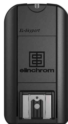
EL-Skyport Receiver Plus 19369

The EL-Skyport Receiver Plus offers flash triggering for classic Elinchrom flash units and other flash brands. The receiver Plus can be connected to flash units which do not offer the built-in EL-Skyport receiver. The additional hotshoe can be used to connect and trigger speedlights.