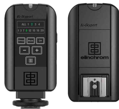
EL-Skyport Universal Plus set 19370

This set includes the Transmitter Plus and the Receiver Plus, to enable EL-Skyport triggering for classic Elinchrom flash units and speedlights which can be connected to the additional hotshoe connection of the Receiver Plus.