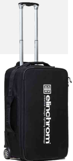
ProTec Location bag N° 33195

Quality and craftsmanship throughout, the ProTec