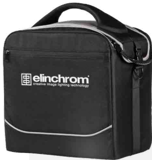
ProTec Bag Poly N° 33196

The smart new ProTec Bag is designed to safely transport or store up to two Elinchrom compact flash units, up to two complete Quadra systems, or a combination of heads and accessories.