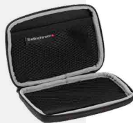
EL-Tube Bag D-Lite RX One N° 33194

Carries and protects up to three D-Lite RX One