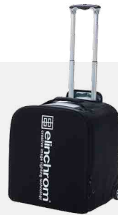
ProTec FS 30 Case N° 33216

Designed to protect and transport the FS 30 Spot. Made out of durable nylon with strong chassis, YKK zippers and user replaceable wheels for your convenience.