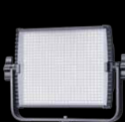
Removable White Diffuser Panel