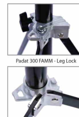
Padat 300 FAMM - Leg Lock

1. 88215 Phottix Padat Compact Light Stand (200cm/79") 2. 88217 Phottix Padat Compact Light Stand (300cm/118")