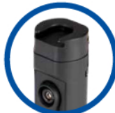
Phone clip with Cold Shoe Mount