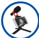
Tripod stand for Stabilizer