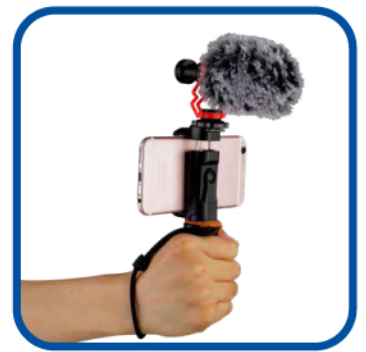
Tripod Selfie Stick for Interviewing and Live Streaming