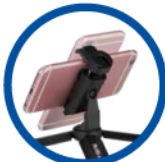
360 Degree Rotating