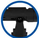
Hemisphere Tilt Head Design