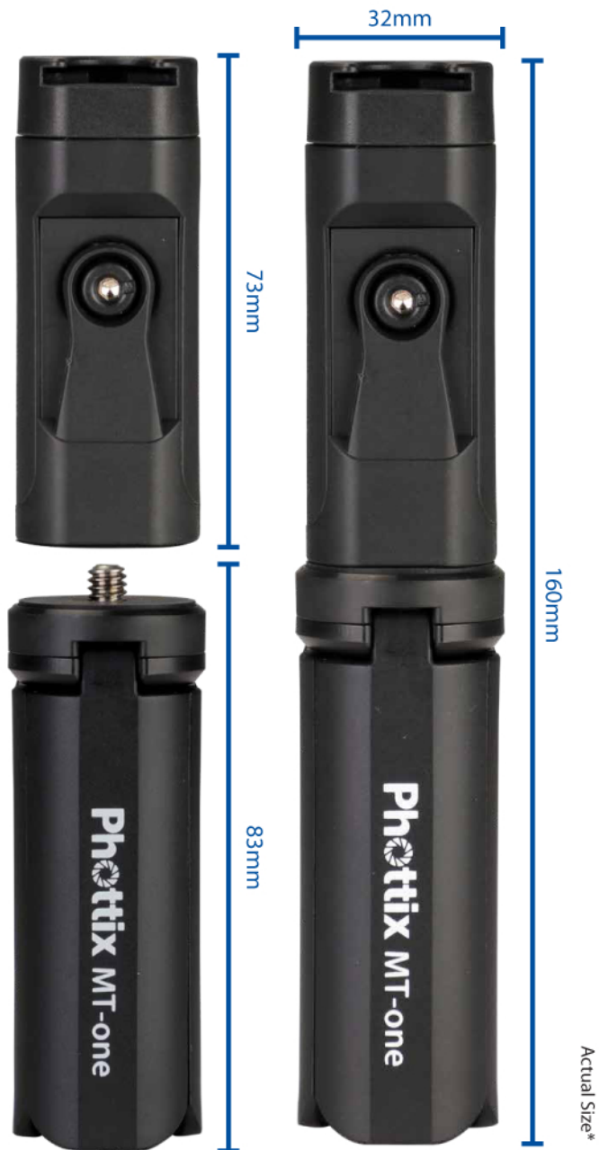
99913 MT-one Smartphone Tripod Kit Set