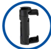
Fits Devices from 2.2 to 3.5"