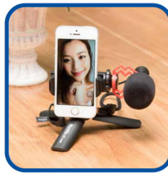
Tripod Stabilizer for Vlogger and Live Streaming