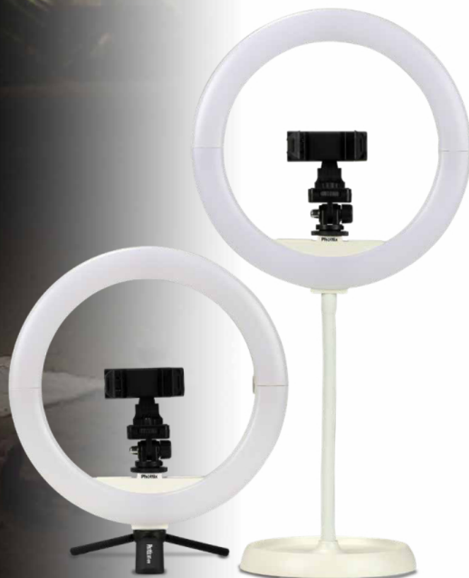
81470 Phottix Nuada Ring10 LED Light Go Kit