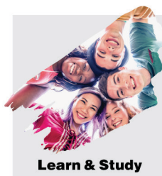
Learn & Study