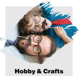
Hobby & Crafts