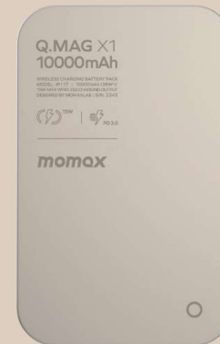
Q.Mag X1 (IP117) 10000mAh