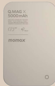
Q.Mag X (IP116) 5000mAh